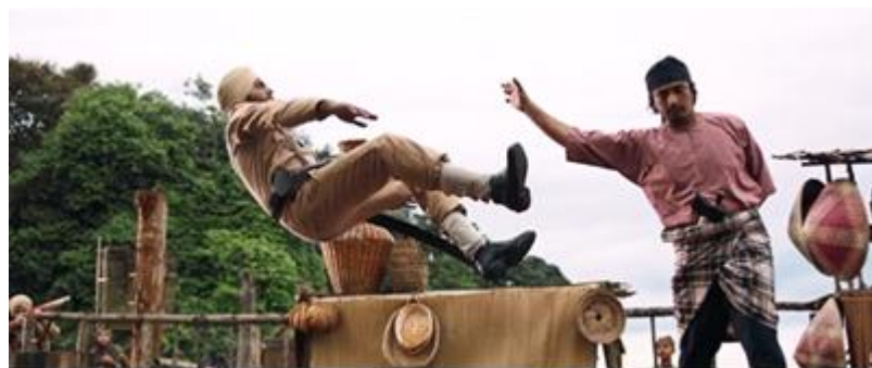
Picture 3: Mat Kilau saves the traders from being harassed by British soldiers